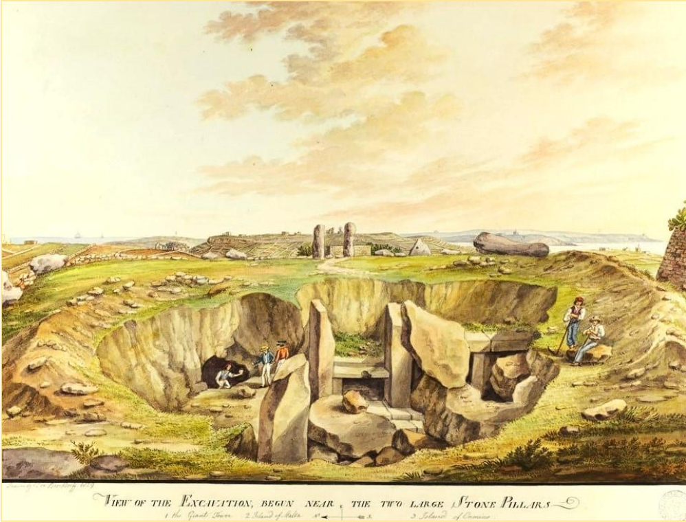
Watercolour of the excavation at the Xaghra Circle by Charles Frederick de Brocktorff in 1829.

the friable nature of the rock forming the roof resulted in a major collapse, reducing the centre of the site to the large hollow cavity visible today. The plot was returned to the farmers once the excavation was complete. However, they were concerned that this agricultural land could be reclaimed by scientists in the future, so it was decided to get rid of the site's landmarks. What was left of the stone circle was quickly destroyed.