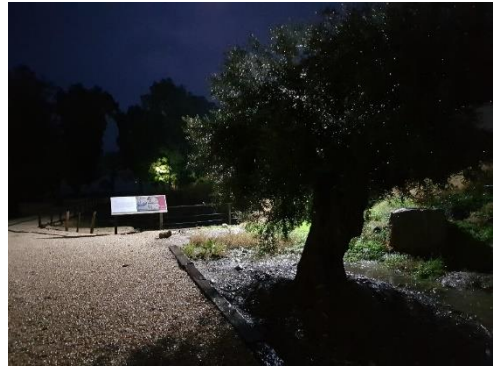
The Olive Tree that offered the essence