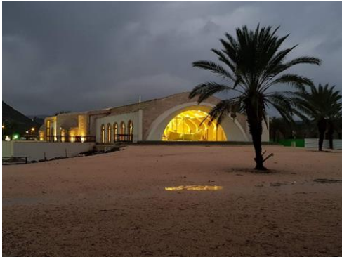
Duc in Altum, the church in Magdala