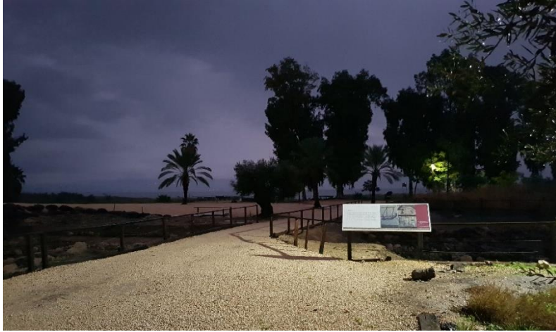
Lake Galilee at dusk. Behind the fence lies the excavated 1 st century harbour