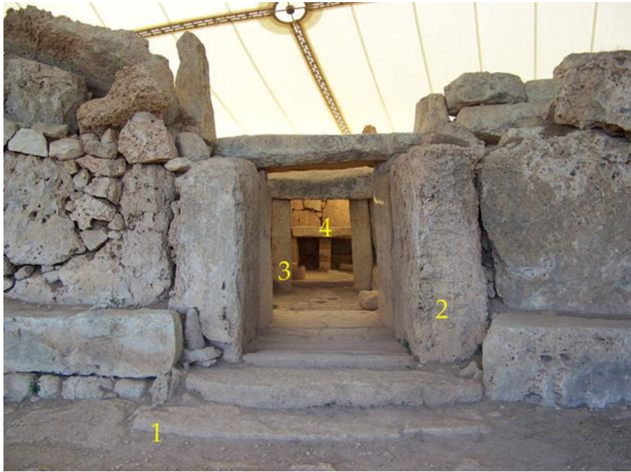
Entrance to the Southern Temple. 1: Courtyard. 2: The main door and entrance passage. 3: Second door. 4: Niche with shrine on the opposite side.