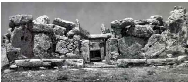
Before the excavations and restorations

The type of rock that one finds on the surface of this part of the island of Malta, is globigerina limestone, a relatively soft, yellowish stone that is still widely used nowadays for construction. Very cleverly designed, the outer walls of the Mnajdra Temples are built in hard coralline limestone – more resistant to weathering – while the softer globigerina limestone is used inside in order to allow a more elaborate finishing and carved decoration, such as neatly pitted surfaces.